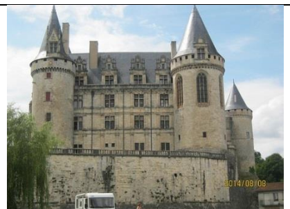
France-French-Humanities-Internships-Service Learning Study Abroad 2014