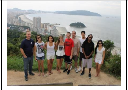
Brazil Study Abroad 2014