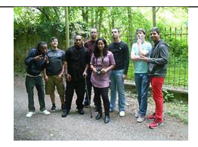
Germany-France Study Abroad 2014