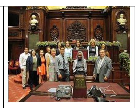
France-Belgium Study Abroad 2014