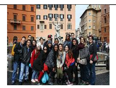
Italy-Greece Study Abroad 2014