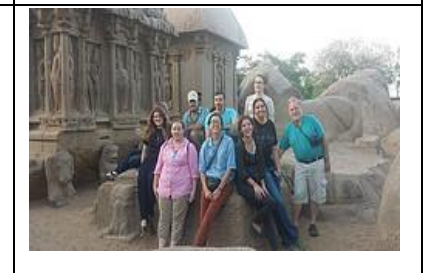
India Study Abroad 2014