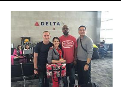
China Study Abroad 2014