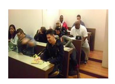
Italy Culinary Study Abroad 2014