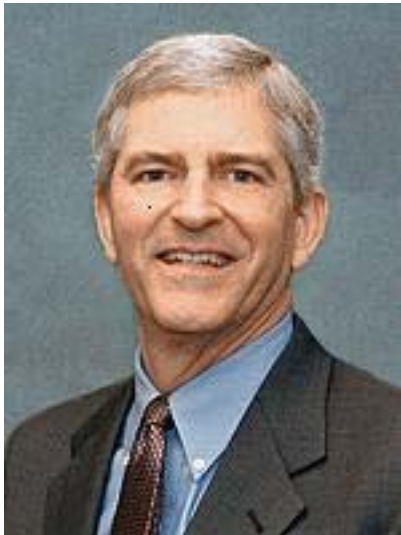
Senator Daniel Webster

The full text of all bills is available online at http://www.leg.state.fl.us Please Note: All matters reported are subject to Governor's Veto