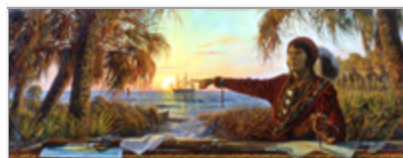
Patriot and Warrior