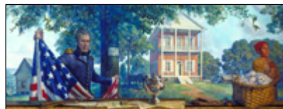
A New Capital

The simplest way to see the final version of a bill is to go to www.flsenate.gov and enter the bill number in the space provided on the top of the homepage, or go to www.flhouse.gov and click on the top tab "Bills." Senate bills are always even numbers (SB 00) and House bills are always odd numbers (HB 11). On the House site, note that you may choose either chamber or choose "both." When you enter the bill number, the history of the bill will appear. For bills that have passed, go to the section on "Bill Text" and choose the entry followed by "ER," which is the most recent, enrolled version of the bill. An enrolled bill is the one being sent to the Governor. For bills that have not passed, go to the section on "Bill Text" and choose the entry with the latest date, which is the final version of the bill before it failed.