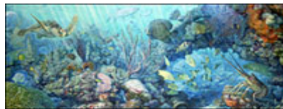
Beyond the Seven Mile Bridge