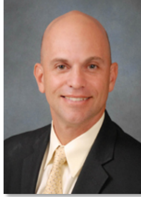
Representative Rene Plasencia (R) District 50

District Address: Brevard County Government Center North 400 South Street, Suite 1C Titusville, FL 32780-7610 Phone: (321) 383-5151