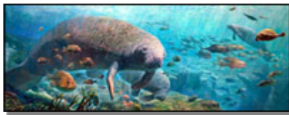
Spring of Life