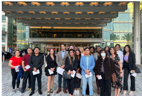
Chicago 25th Anniversary Tour