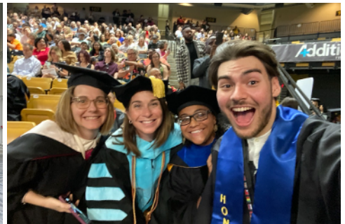
Spring 2023 Commencement