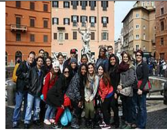
Italy-Greece Study Abroad 2014