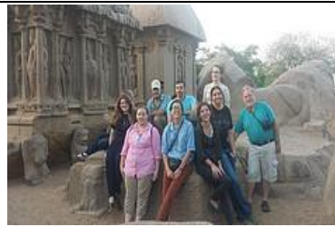
India Study Abroad 2014