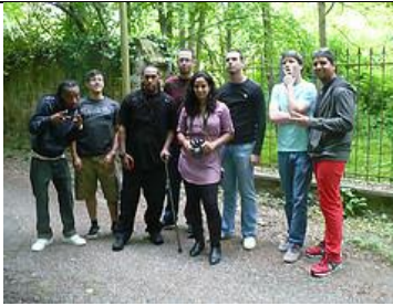
Germany-France Study Abroad 2014