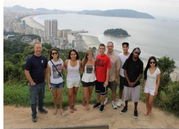
Brazil Study Abroad 2014