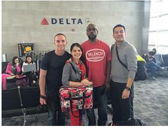
China Study Abroad 2014