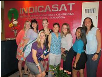
Panama Study Abroad 2014