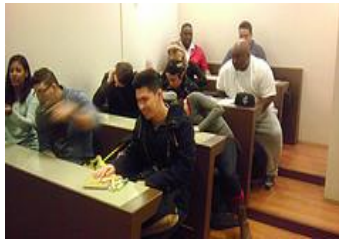
Italy Culinary Study Abroad 2014