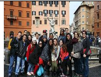
Italy-Greece Study Abroad 2014