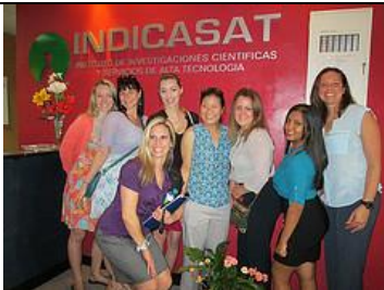
Panama Study Abroad 2014