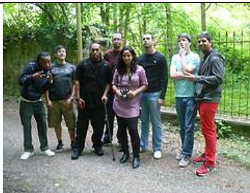
Germany-France Study Abroad 2014