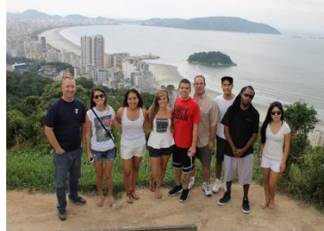
Brazil Study Abroad 2014