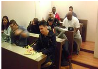
Italy Culinary Study Abroad 2014