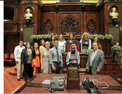
France-Belgium Study Abroad 2014