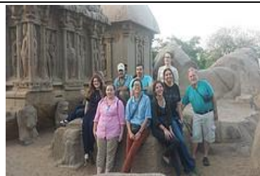
India Study Abroad 2014