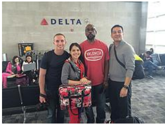
China Study Abroad 2014